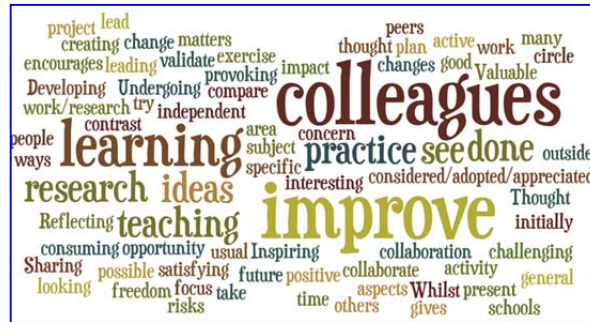
Figure 7 – A wordle picture