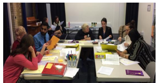
The Watford TLDW group in action