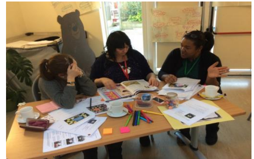
The Early Years TLDW group Ludwick Children's Centre