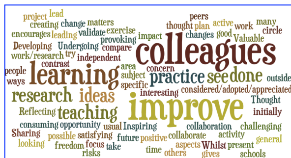
Figure 7 – A wordle picture